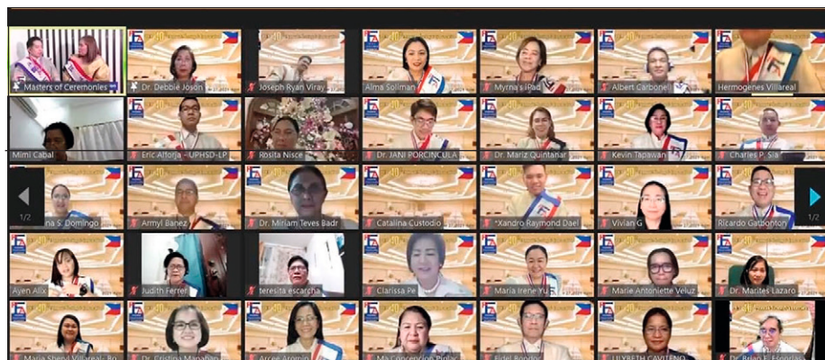
PFA Fellows attending the virtual Annual Convocation on October 27, 2021.