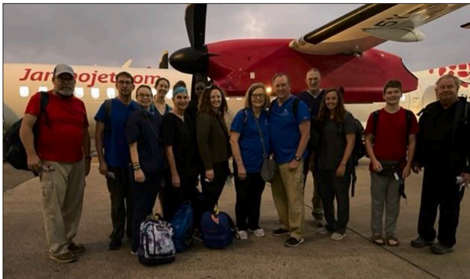
The team waiting to board a plane to the next clinic location.