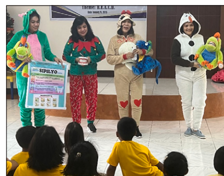
Four PFA Fellows educating the children on oral health.

Our PFA Fellows also took the opportunity to educate the children on oral health, teaching them how to properly take care of their teeth. The children left with full stomachs, new dental hygiene supplies, and a sense of hope for the future. They were grateful for the support and showed their appreciation by performing dance and singing numbers. It was a truly inspiring and heartwarming event, where individuals from the PFA and PAED came together to make a difference in the lives of the children at the orphanage. The Bukal ng Buhay Orphanage is a place of hope, growth, and love, and the children who call it home are a source of inspiration to us all.