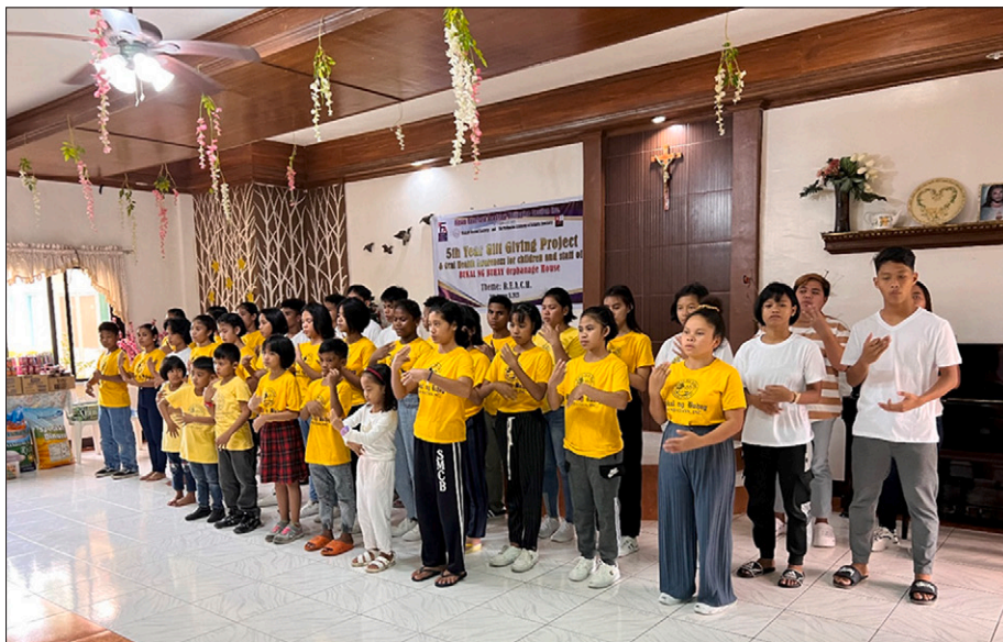
Children at the orphanage show their appreciation by performing dance and singing numbers.