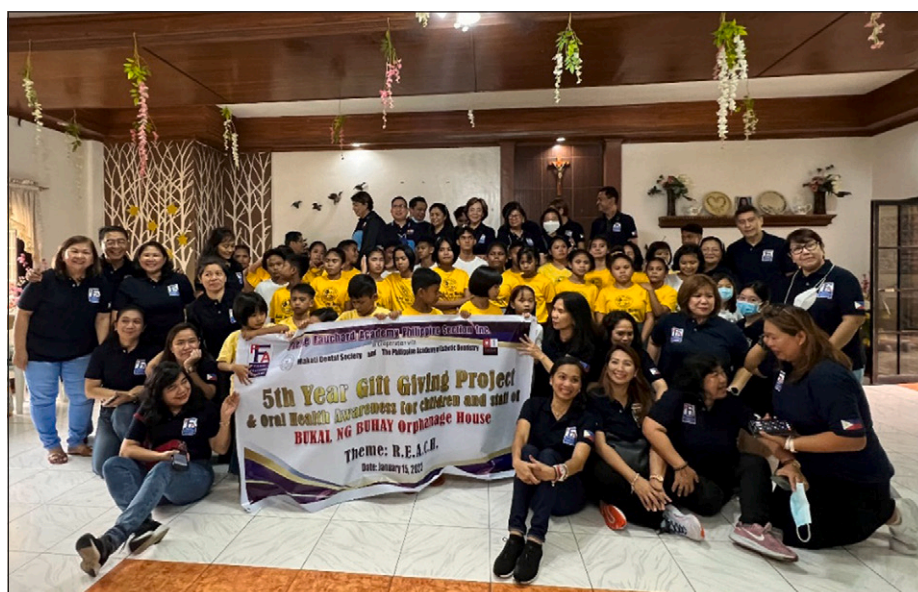
Children at the Bukal ng Buhay Orphanage together with PFA Fellows from the Philippine Section and Members of the Philippine Academy of Esthetic Dentistry.