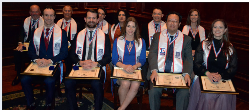
New Fellows following their induction.