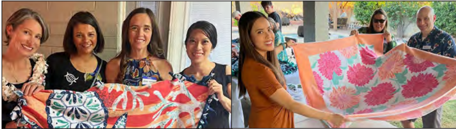
Fellows with blankets for the Amanda Hope organization

We combined this event with our philanthropy project, which has involved making 60 blankets for the Amanda Hope organization for children undergoing cancer treatment.