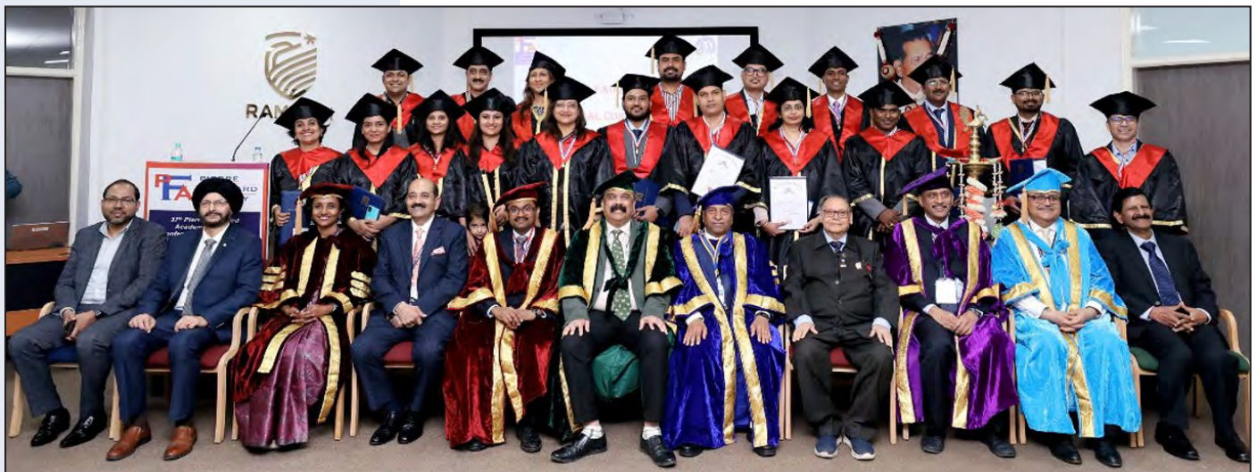
Newly installed Fellows together with dignitaries of the India Section.