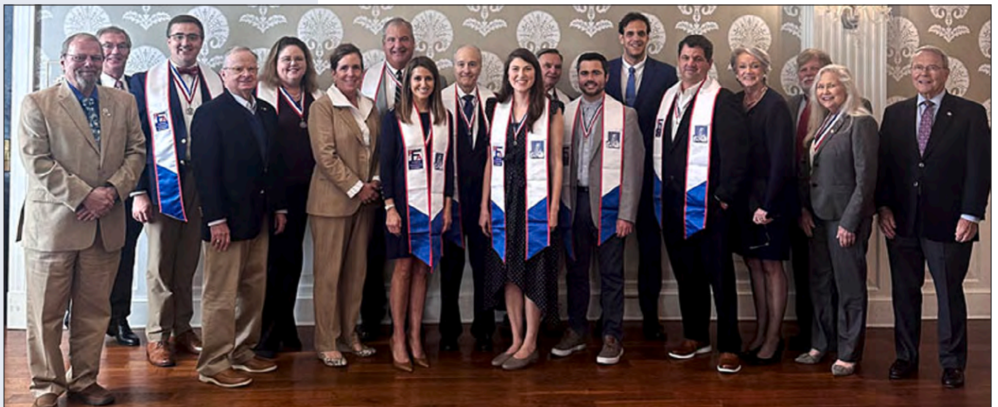
Newly-inducted Fellows together with the South Carolina Section leadership team and Fellows.