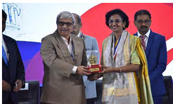
PIC 11: HONOURING OF SECRETARY , PFA INDIA SECTION