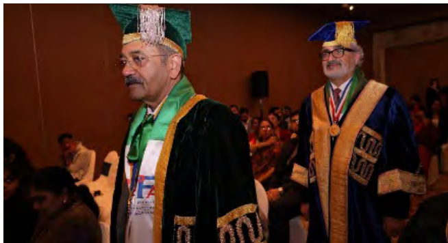
PIC 34 : CONVOCATION PROCESSION