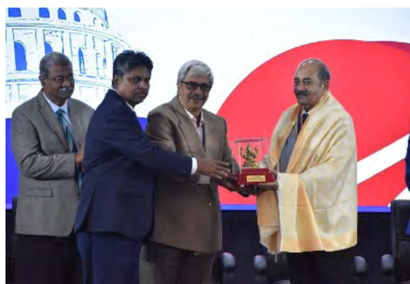
PIC 10 : HONOURING OF CHAIRMAN, PFA INDIA SECTION