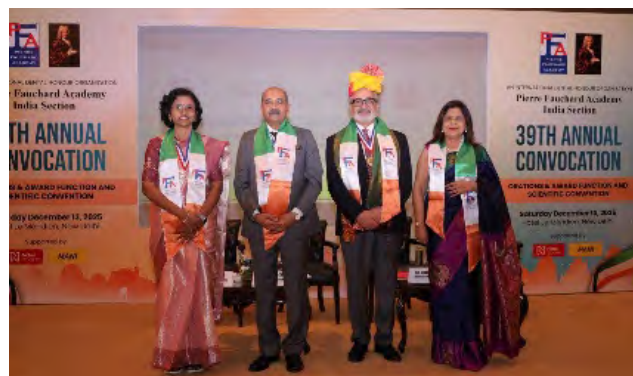
PIC 20 : INAUGURAL STAGE WITH CHIEF GUEST