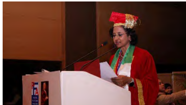
PIC 35 : SECRETARY PFA INDIA SECTION AS MASTER OF CEREMONY