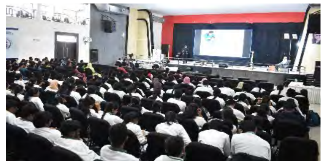
PIC 18 : THE AUDIENCE