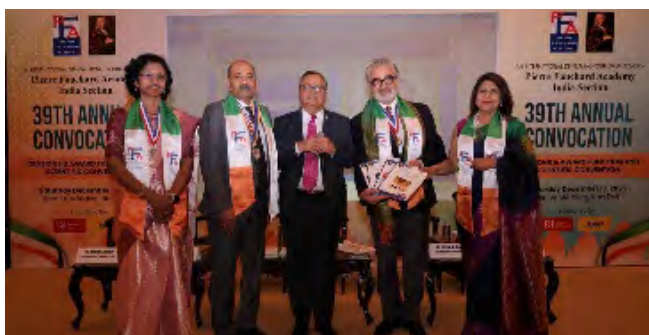
PIC 30 : RELEASE OF ALL FOUR ISSUES OF JPFA BY CHIEF GUEST