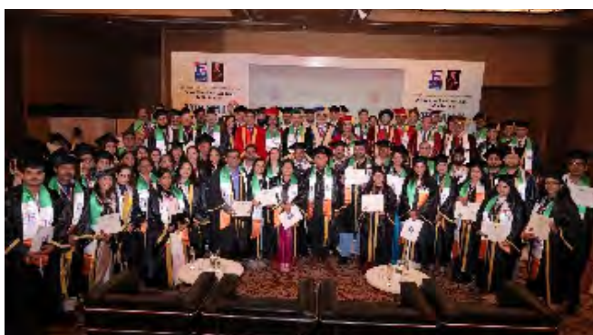
PIC 44 : 116 NEW FELLOWS OF 2025 CONVOCATION WITH SENATE MEMBERS