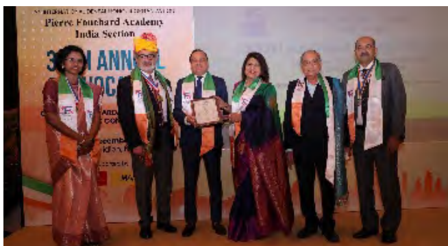
PIC 15 : HONORING THE GUEST SPEAKER BY THE CHAIRPERSON