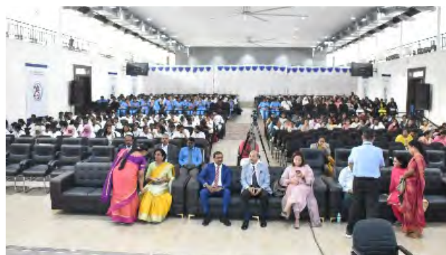
PIC 4 : INAUGURAL CEREMONY AUDIENCE