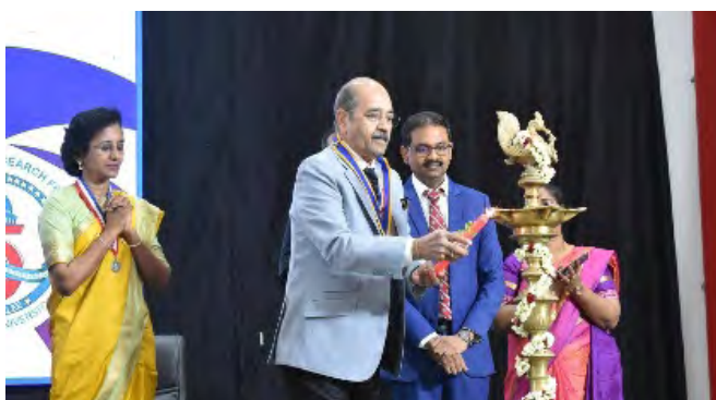
PIC 3 : LIGHTING OF THE LAMP BY CHAIRMAN