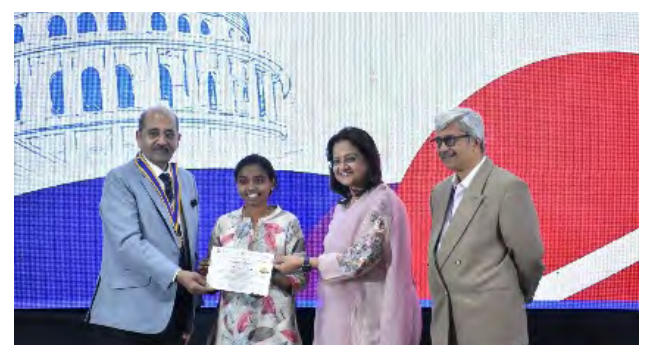
PIC 20 : SCIENTIFIC EVENTS - CERTIFICATE DISTRIBUTION