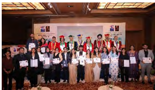
PIC 45 : ALL AWARDEES OF 2026 WITH SENATE MEMBERS