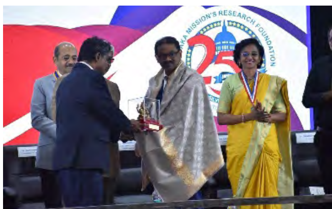
PIC 9 : HONOURING OF CHIEF GUEST