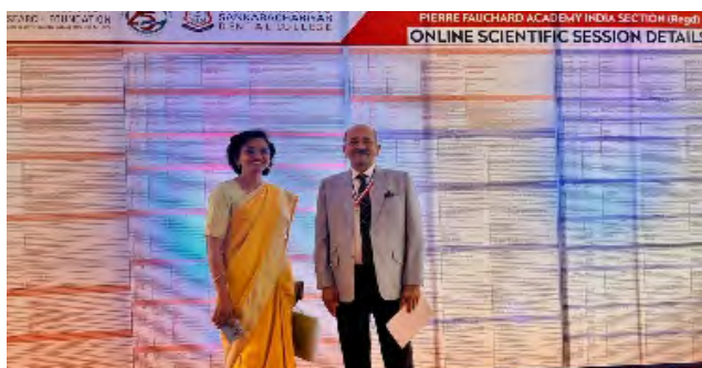
PIC 19: CHAIRMAN AND SECRETARY PFA INDIA SECTION