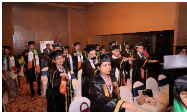
PIC 38 : PLEDGE - NEW FELLOWS