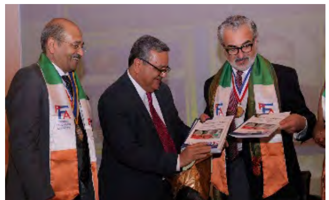
PIC 29: HANDING OVER OF THE FOUR ISSUES OF THE JOURNAL OF PIERRE FAUCHARD ACADEMY