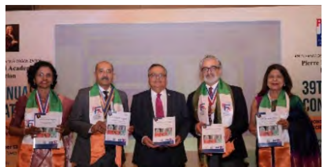
PIC 31 : RELEASE OF THE JOURNAL OF PIERRE FAUCHARD ACADEMY INDIA SECTION