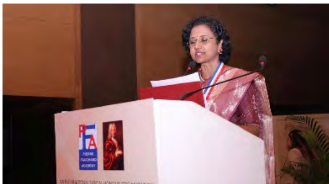
PIC 17 : INTRODUCTION OF PFA AND BRIEFING OF PFA ACTIVITIES OF INDIA SECTION IN 2025