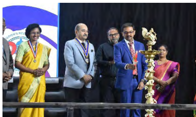
PIC 2 : LIGHTING OF THE LAMP BY CHIEF GUEST PRO VICE CHANCELLOR VMRF DU