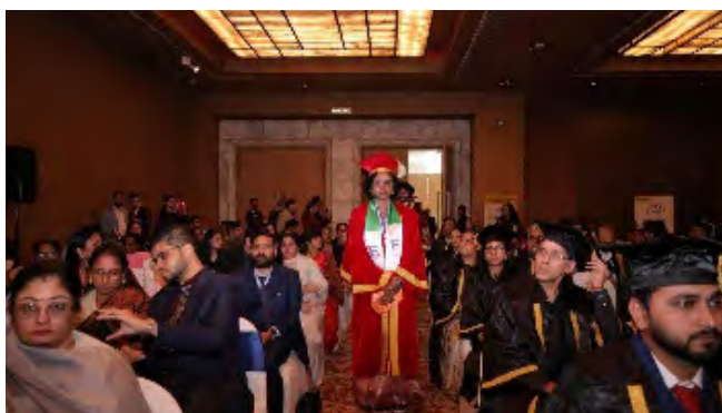
PIC 32 : CONVOCATION PROCESSION