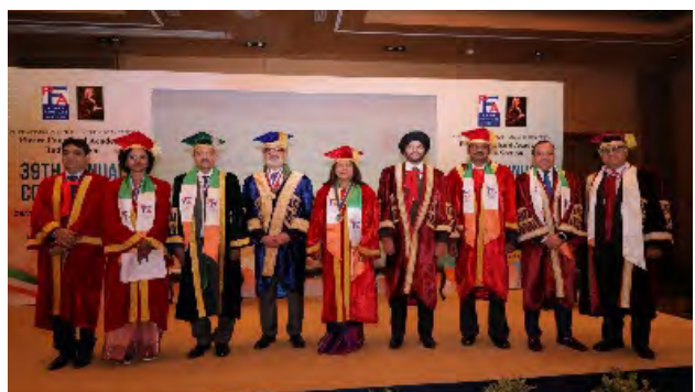
PIC 49: SENATE MEMBERS WITH INTERNATIONAL PRESIDENT AND HONORARY FELLOW