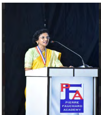
PIC 5 : INTRODUCTION OF PFA BY secretary PFA INDIA SECTION