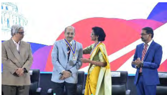
PIC 1 : PFA - CDE IN VINAYAKA MISSION'S SANKARACHARIYAR DENTAL COLLEGE