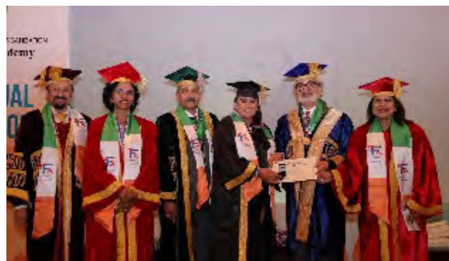
PIC 37 : FELLOWSHIP CERTIFICATES TO NEW FELLOW