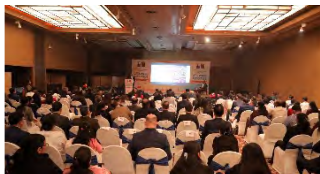
PIC 8 : IC 8: AUDIENCE