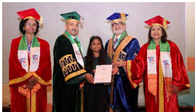
PIC 43 : BEST OUTGOING STUDENT AWARD