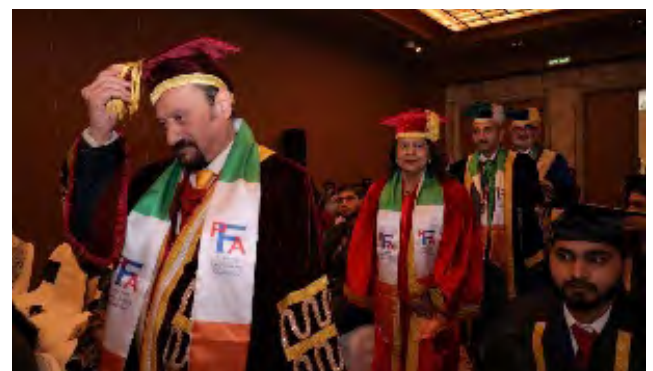
PIC 33 : CONVOCATION PROCESSION