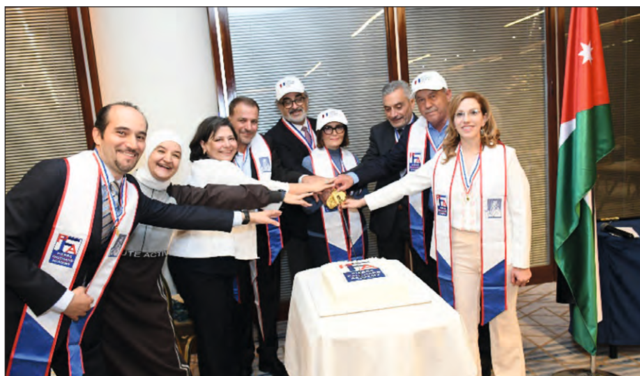
Cake-cutting to celebrate our new Fellows.